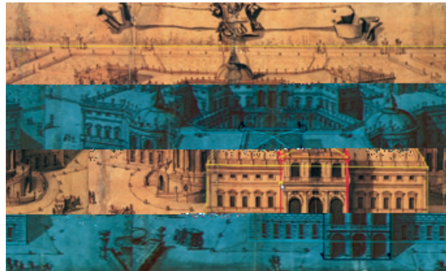
Software technology adapted to scholarly needs allows new information to be extracted from artistic works. In identifying an elementary building block in Filippo Juvarra's (1678–1736) perspectival representation of a royal palace, it becomes possible to reconstruct a full 3D digital model.